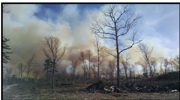
16-Mile Fire, Pike and Monroe Counties - 2016

"Despite past cold temperatures and snow cover across much of the state, spring weather has shown it just takes a few days of sun and wind to allow brush and forest fire danger to develop quickly," said Cindy Adams Dunn, Secretary of the Pennsylvania Department of Conservation and Natural Resources (DCNR). "Most of the reported fires last year are linked to people; people cause 98 percent of wildfires. A mere spark by a careless person can touch off a devastating forest blaze during dry periods when conditions enable wildfires to spread quickly."