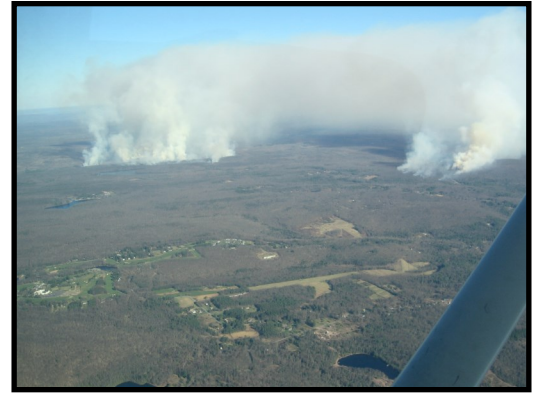
16-Mile Fire, Pike and Monroe Counties - 2016

DCNR's Bureau of Forestry is responsible for prevention and suppression of wildfires on the 17 million acres of state and private woodlands and brush lands. The bureau maintains a fire-detection system, and works with fire wardens and volunteer fire departments to ensure they are trained in the latest advances in fire prevention and suppression.