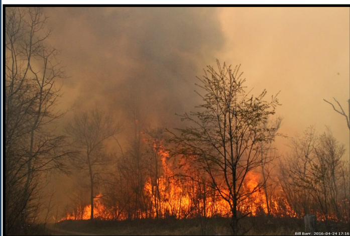
16-Mile Fire, Pike and Monroe Counties - 2016

DCNR statistics show nearly 85 percent of Pennsylvania's wildfires occur in March, April and May, before the greening of state woodlands and brushy areas. Named for rapid spread through dormant, dry vegetation, under windy conditions, wildfires annually scorch nearly 7,000 acres of state and private woodlands.