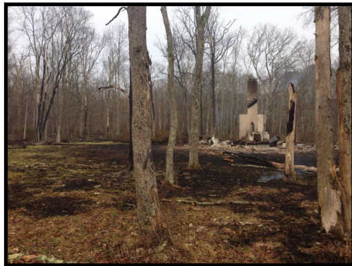
16-Mile Fire, Pike and Monroe Counties - 2016

Communities in heavily wooded areas are urged to follow wildfire prevention and suppression methods of the Pennsylvania Firewise Community Program ( https://www.nfpa.org/Public-Education/By-topic/Wildfire/Firewise-USA ) to safeguard life and property.